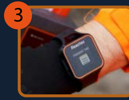
3. Pair using watch button

Go to the beacon. The beacon must be powered. If driver or banksman controlling the beacon ask for permission to access.