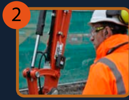
2. Approach the vehicle

An operator card with "can manage beacons" and "can change beacon range" credentials will be needed. Unclip any R-Link with a Reactec logo indicating it is ready for use and present operator card.