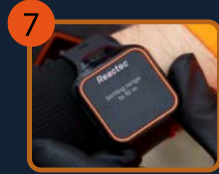
7. Screen confirms new range

Screen confirms pairing and advises current range. Scroll through until the new desired range is displayed then press the left hand button to select.