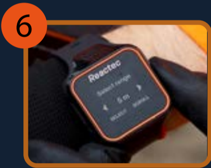
6. Select new range

To configure a beacon Press the left hand button configure.