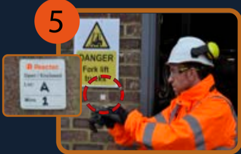
5. Enter the safe zone

When you move away from the vehicle the alerts will stop and the watch screen will return to normal.