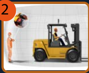
2. Exclusion Zones

Unclip any R-Link with a Reactec logo indicating it is ready for use and present operator card programmed for safe zone access.