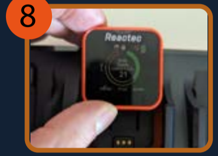
8. Return watch

To leave a safe zone connect again to either the same safe zone tag or another safe zone tag positioned at the exit of the safe zone. Should you neglect to connect again to leave the safe zone, a time out programmed in the safe zone tag will automatically switch beacon alerts back on.